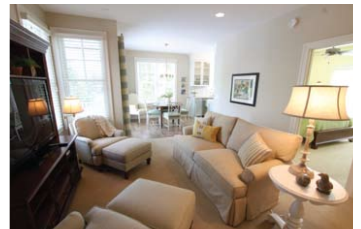
ABOVE: A private master suite is situated away from the hustle and bustle of the house. MIDDLE LEFT: The master bath stays true to the luxury throughout the house. MIDDLE RIGHT: A lower level kitchen accommodates entertaining poolside for large and small gatherings. BELOW: This lower level living space provides just the right mix of warmth, comfort and luxury.