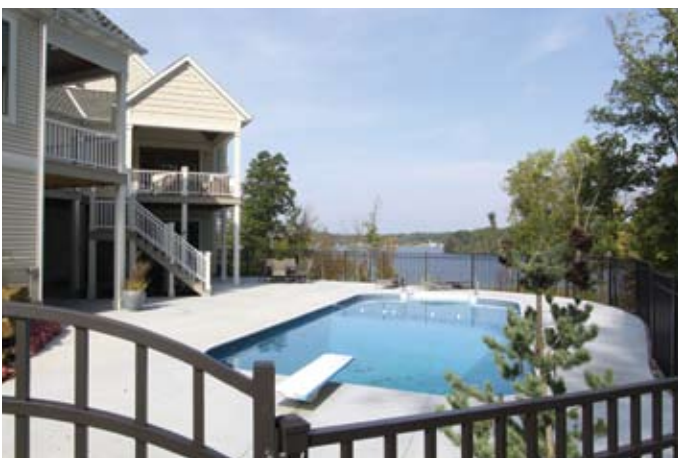
ABOVE: The covered patio overlooks the pool, pond, lake and woods.